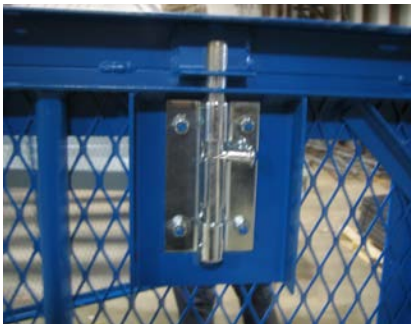
Optional latch bolt locking hardware