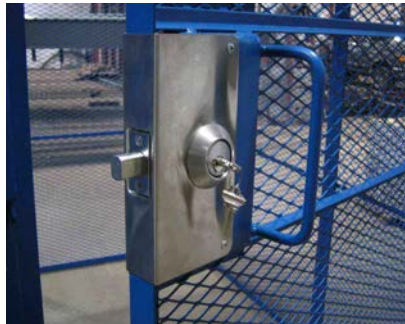
Optional keyed entry lock