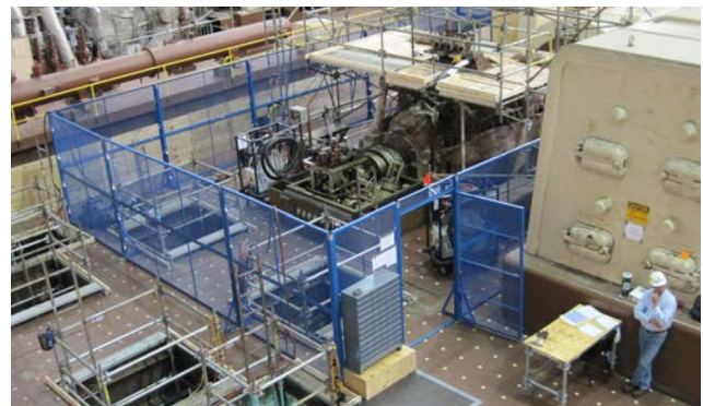
Range of enclosure and wall system configurations