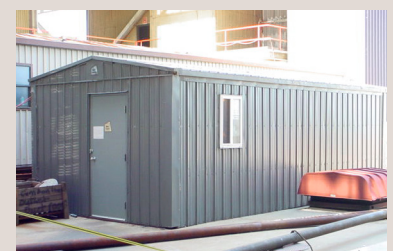
Pre-installed insulation, windows and doors