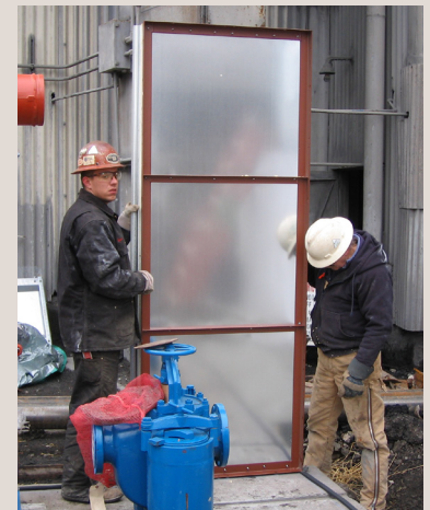
Plain galvanized or painted steel sheeting