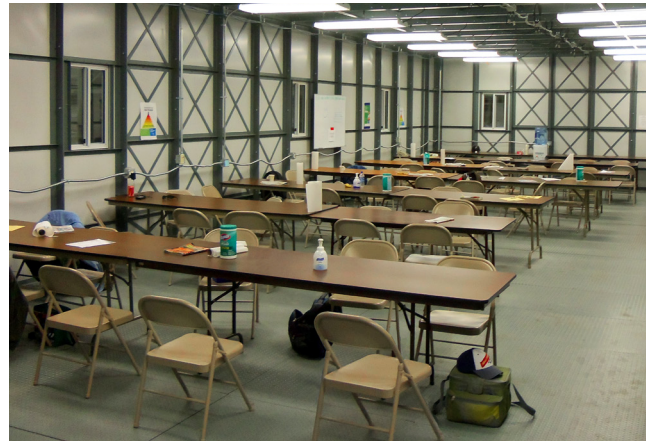
Decrease downtime by having tool and break rooms close to where crews are working.