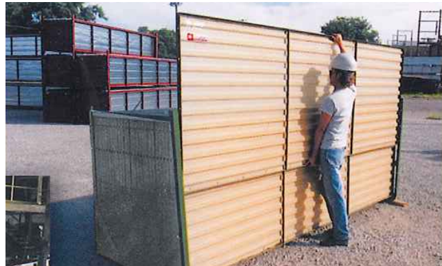
Shipping and storage frames reduce the amount of storage area needed and assure efficient handling.