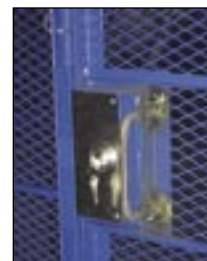
Optional locking hardware includes latch bolt (far left photo) and keyed entry lock.

* The optional partition post brace is to be utilized on applications where the partition post cannot be physically anchored to the surface.