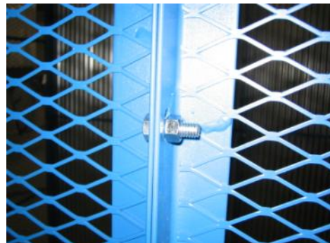
Bolted Connections For higher security applications.