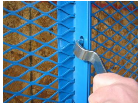
3/4-13 Flattened Steel Expanded Metal with Standard Blue Enamel Finish