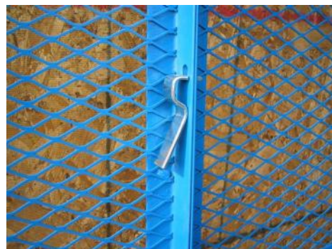
Kelly Klosure's Patented Locking Key Faster assembly and disassembly without need for tools.