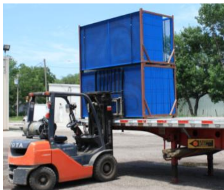
Easy to Handle Panel Racks