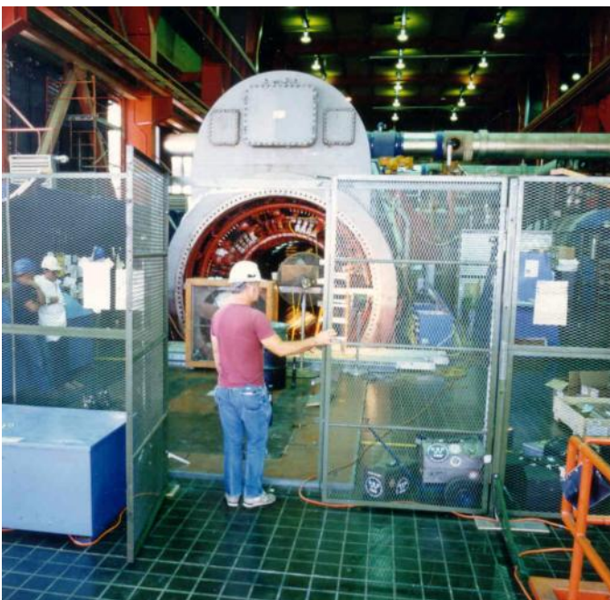
Access Control During Power Plant Outage Work (FME Barrier)