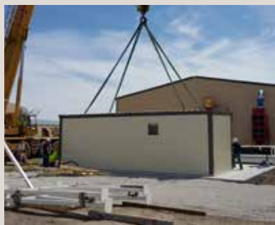
5. Drop in place