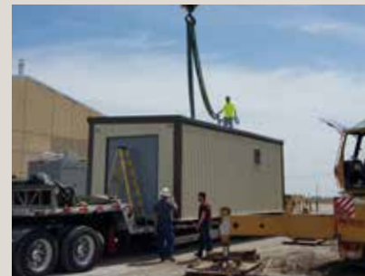
3. Preparing to unload