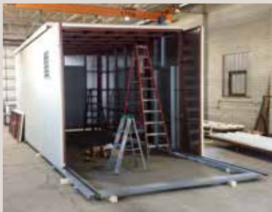
1. Factory assembly