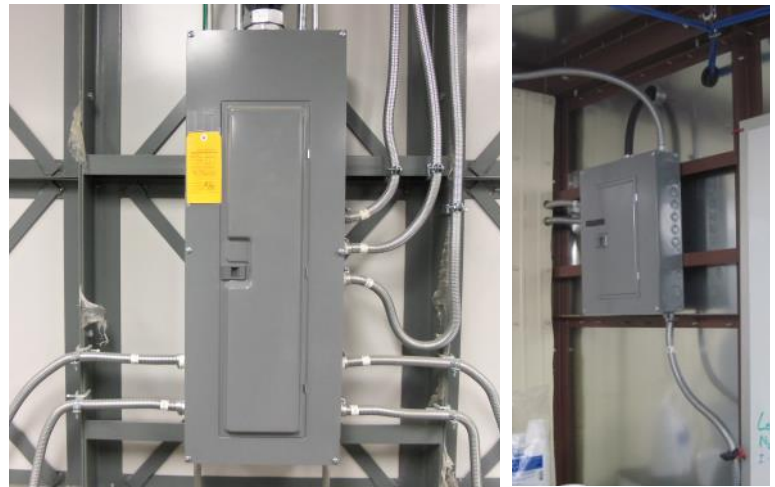
Factory Mounted Panel for Simple Installation