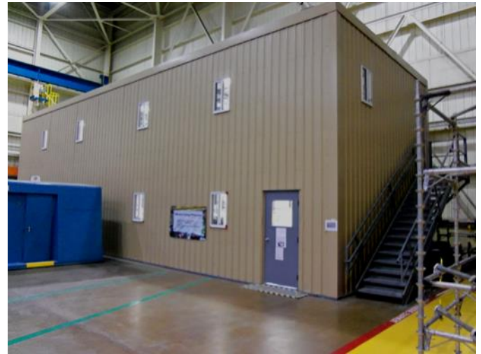
2-Story Flat Roof Interior Building used for Power Plant Outage Support