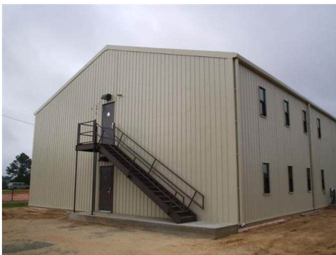
2-Story Administration Building at Ft. Bragg, NC