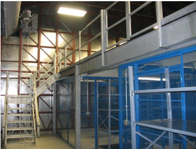
Building with Kelly Expanded Metal Lockers on First Floor and 2nd-Floor Storage Level

Kelly Klosure System's buildings can be designed as 2-story structures. On larger structures, a free-standing Kelly Klosure mezzanine would be installed inside of the building to create the 2nd floor. On smaller buildings, a panelized floor system is integrated into the building design to create the 2nd floor. This floor system has factory welded checker plate steel flooring installed on modular panel frames.