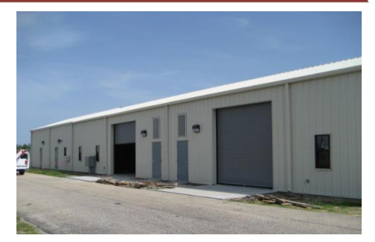
Building with Hurricane Rated Doors & Windows