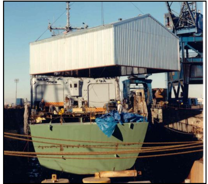
Crane Liftable Building at Shipyard

(Note: Spreader beam and rigging is designed and supplied by others.)